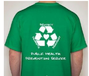
2012's Winning T-Shirt Design